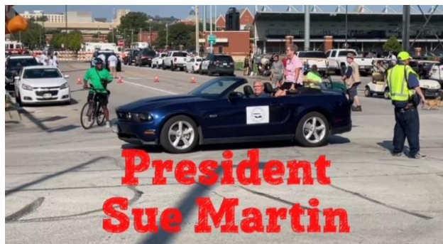
(2021 SeptemberFest: Salute to Labor Parade, Omaha, NE)

Right now, union organizers across the country are fighting not just for dignity and respect on the job, but to ensure our right to vote—a fundamental cornerstone of our country's democracy—is protected.