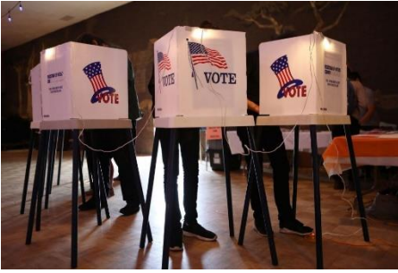
Voters casting ballots.

According to the most recent data from Pew