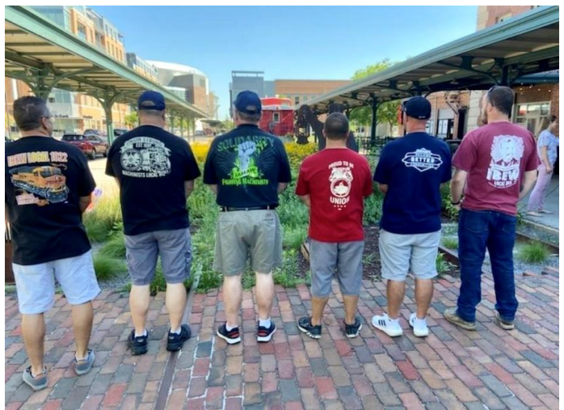
Railroad Craft Unions T-shirts