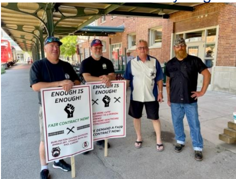
IAMAW Local Lodge 612