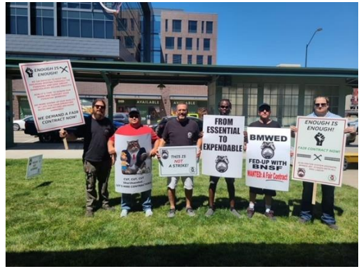
IBEW Local 1022