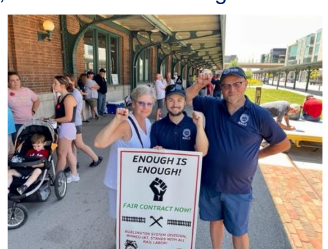
NALC Branch 8