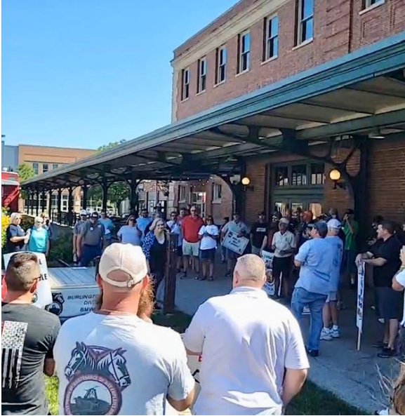
State Senator Carol Blood